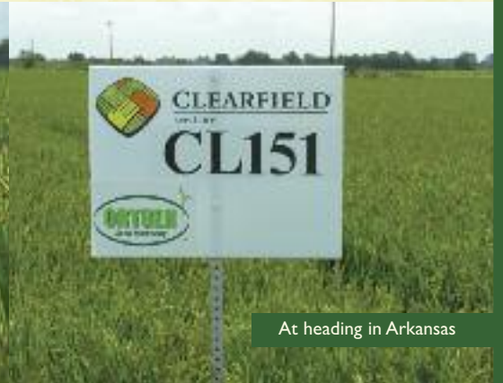
At heading in Arkansas