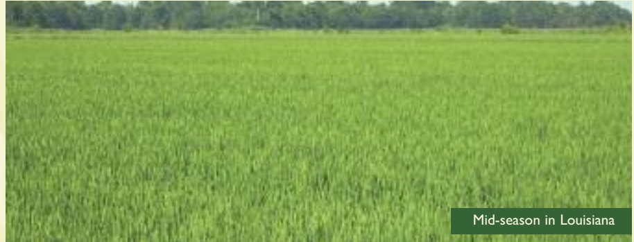
Mid-season in Louisiana

A Horizon Ag demonstration field east of Houston near Winnie, TX planted to CL151 yielded 185 bu/acre (51.3 bbls), which is a high yield for the area. Most of the rice east of Houston is yielding in the 170 to 175 bushel-range (47.2 to 48.6 bbls)