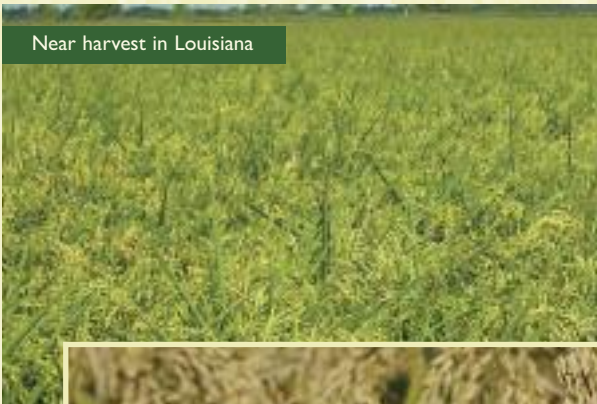
Near harvest in Louisiana