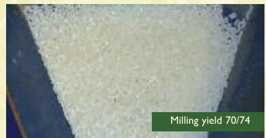
Milling yield 70/74