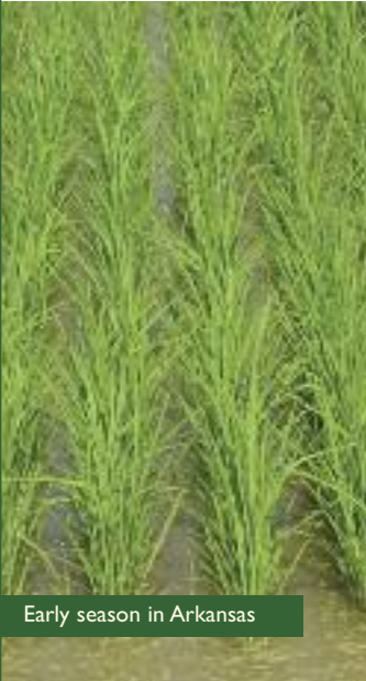
Early season in Arkansas