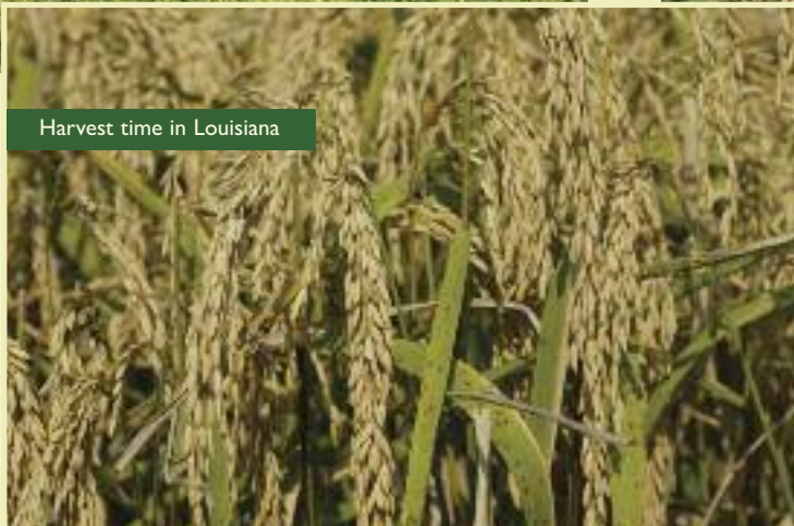
Harvest time in Louisiana