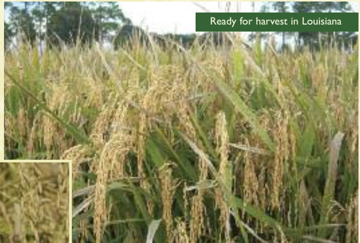
Ready for harvest in Louisiana